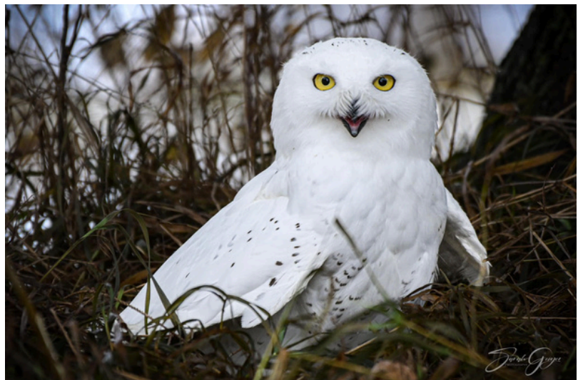
Wesley the Snowy Owl.