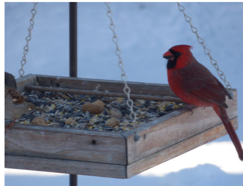
Northern Cardinal

The Chat is the newsletter of the Lakeland Audubon Chapter of the National Audubon Society, P.O. Box 473, Elkhorn, WI 53121. Subscription is $15 per year for printed copies sent by US mail.