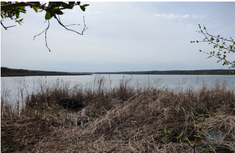
Lake Como (Center Location - Lake Geneva CBC)